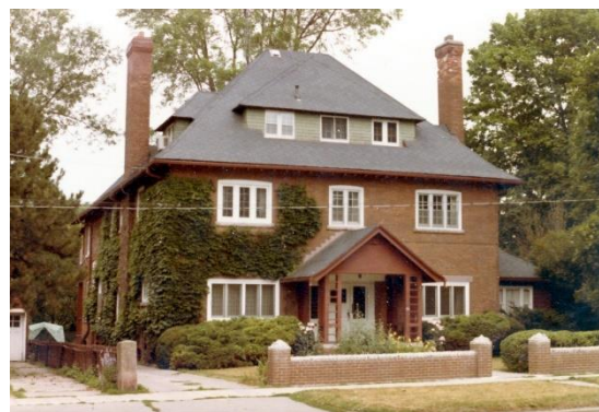
130 King Street East "New Hall"