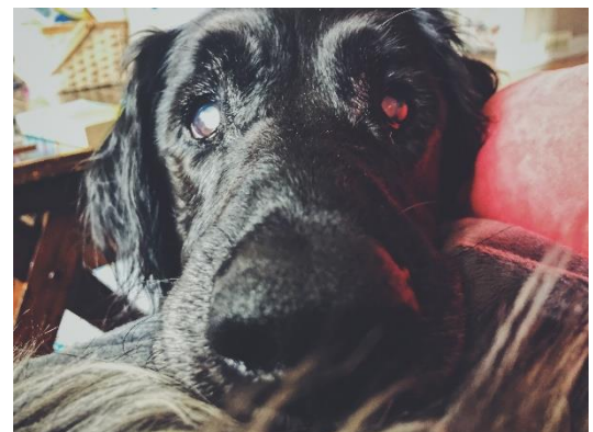
The NCLA Librarian's co-workers spend most of their day begging for snacks and fighting over who gets to nap in the sun.